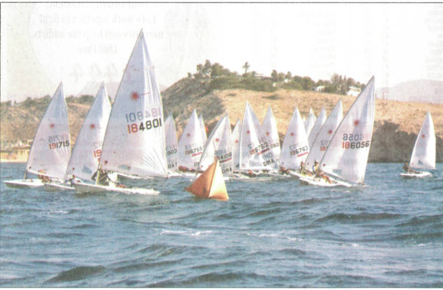
The fleet at the start of race three.

On Friday, the wind was again blowing strong. Just a notch less power full than the day before, creating excellent sailing conditions