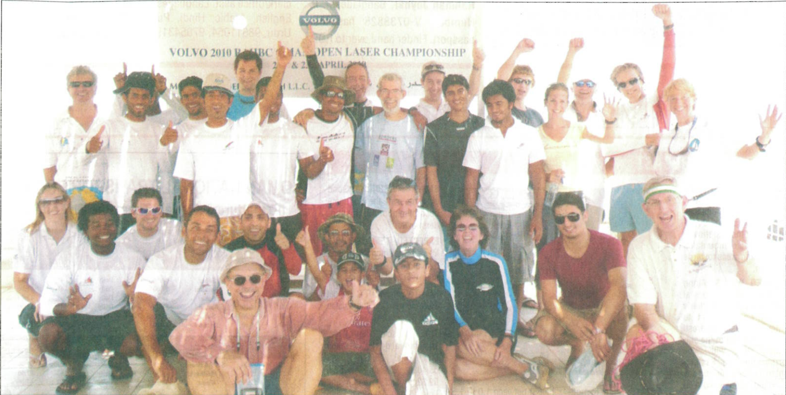
Competitors pose for a picture before the start of the event.