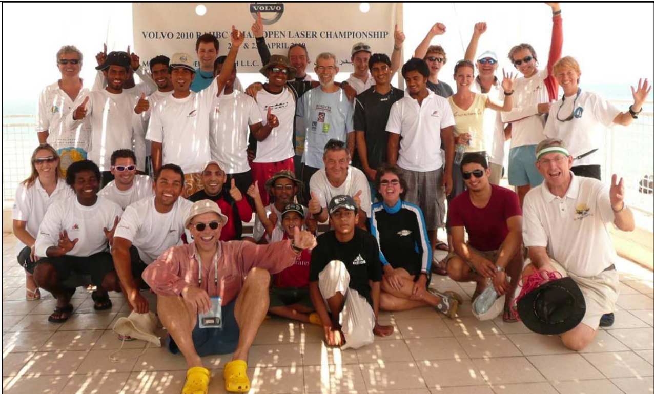
All the competitors before the start of the sailing