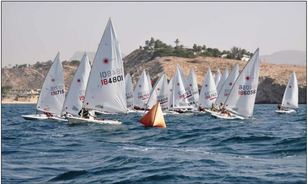
The fleet starting race 3