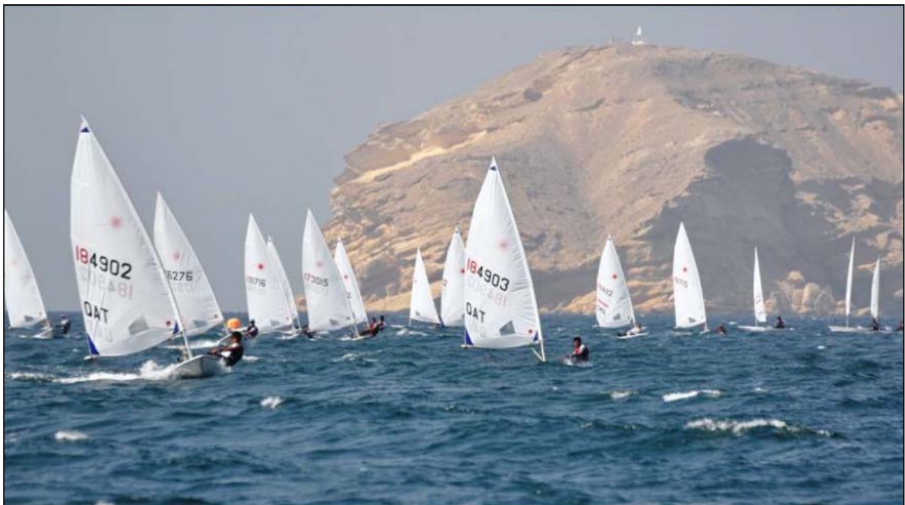
The fleet at full speed towards the down wind buoy with Al Fahal island in the background