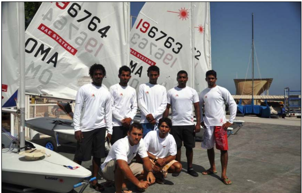
The Oman Sail National Laser sailing team in front of their boats