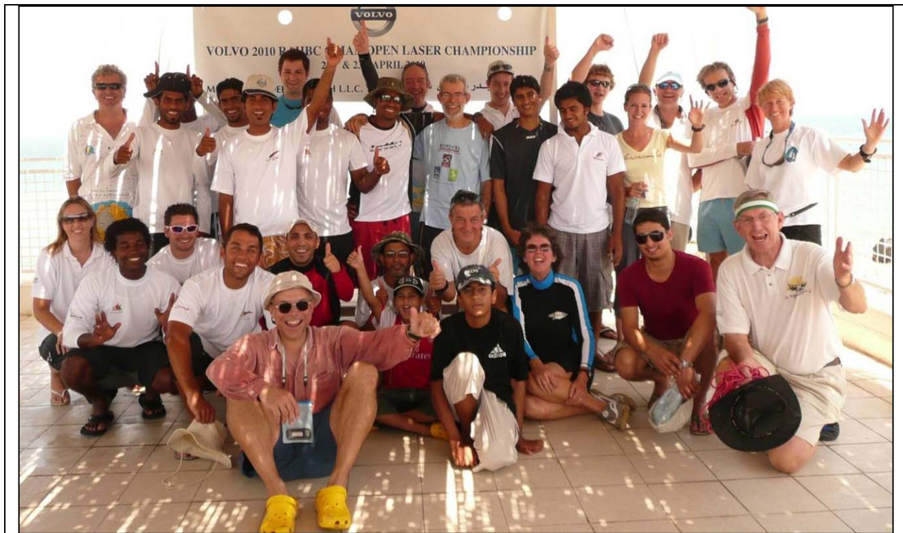
All the competitors before the start of the sailing