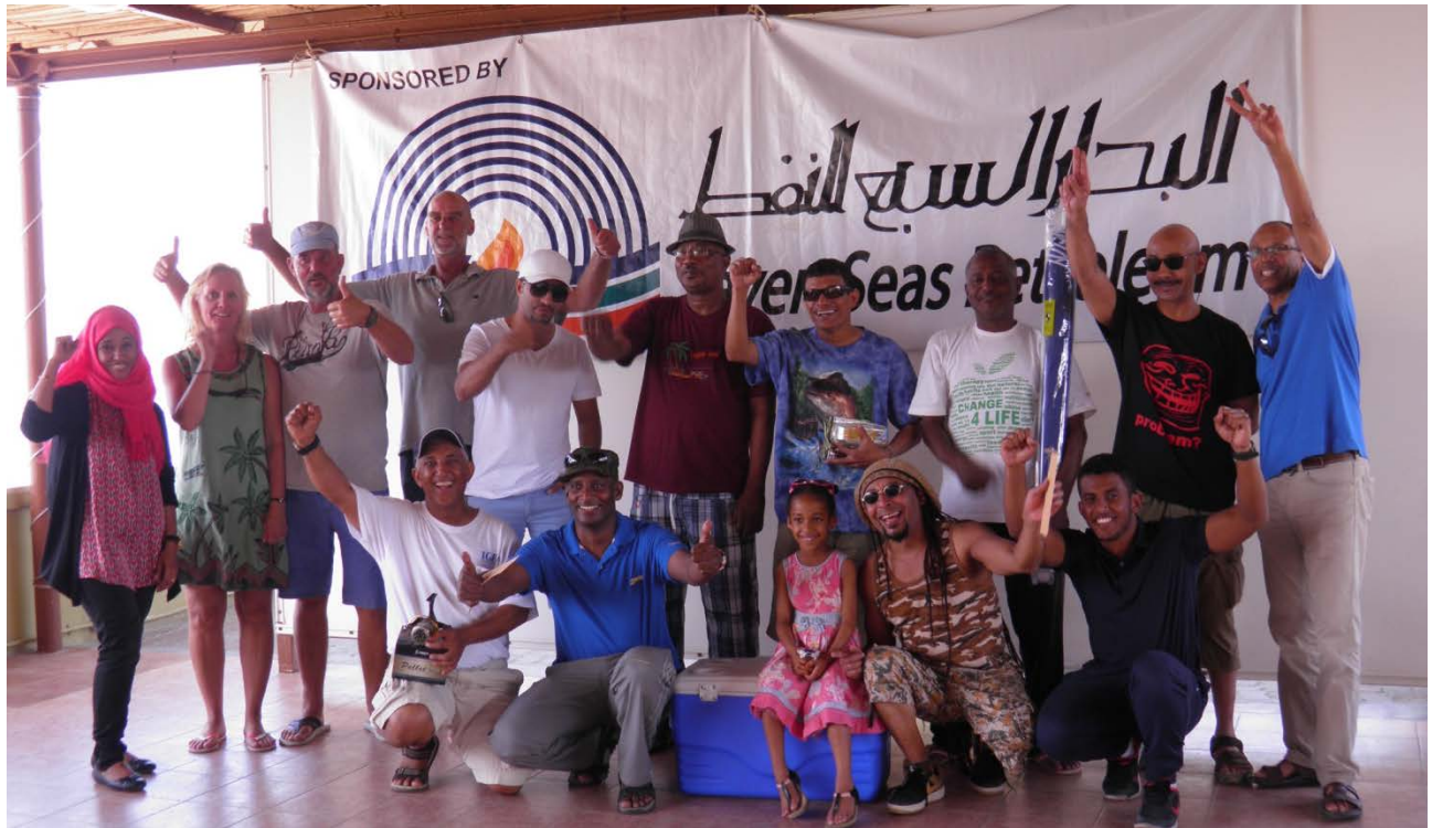
Happy Anglers with their families and friends.