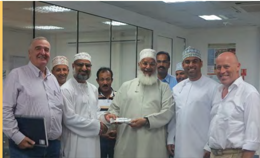
RAH Project officially handed over keys to the first new Apartments Buildings to PDO UIB team for further allocation of employees as new RAH Residents.