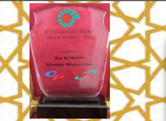
RAH Development Project was awarded by PDO Finance Directorate's for cost saving of $30 million in Capex & $10-15 million in OPEX.