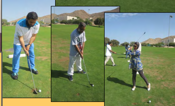
Team Members enjoyed the privilege of the Golf Club where Golf Head Professional gave master class of golfing and hitting at the driving range.