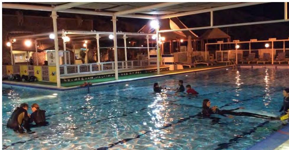
Sports Diver Rescue Training In The Pool