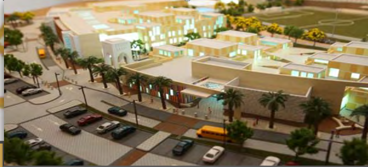
The achieved work progress at new RAH International School site is 85%, and Project is expected to be completed by August 2015. The new RAH International School is a unique building in terms of Green and Sustainability features, the design is in compliance with the principles of LEED standards.