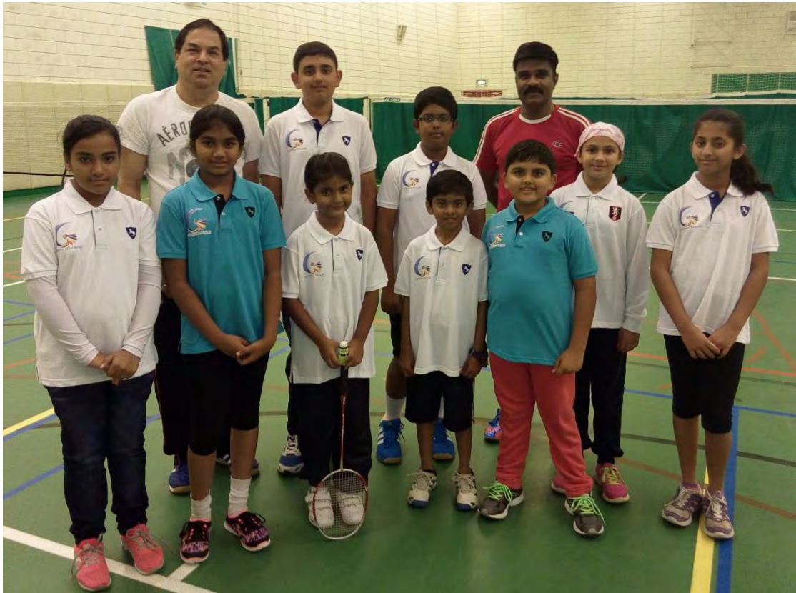
Badminton Coaching for Children – Participants