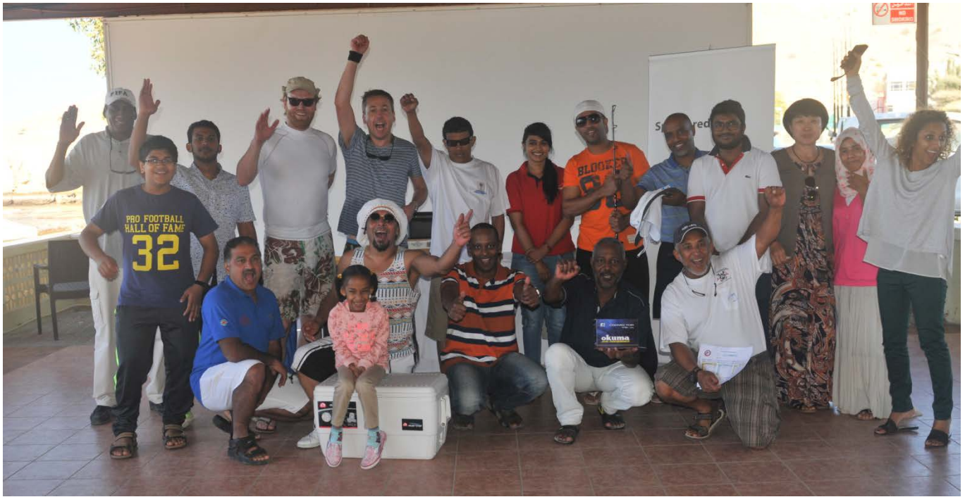
Happy Anglers with families and friends.