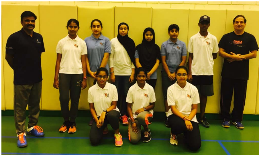
Children badminton coaching – 2 nd batch (Mar to Apr-17)

Second batch of children coaching commenced on 25-Mar-2017 and the sessions are progressing well. Subsequent batches will be finalized by the committee & coach and email notifications will be sent to the registered members individually.