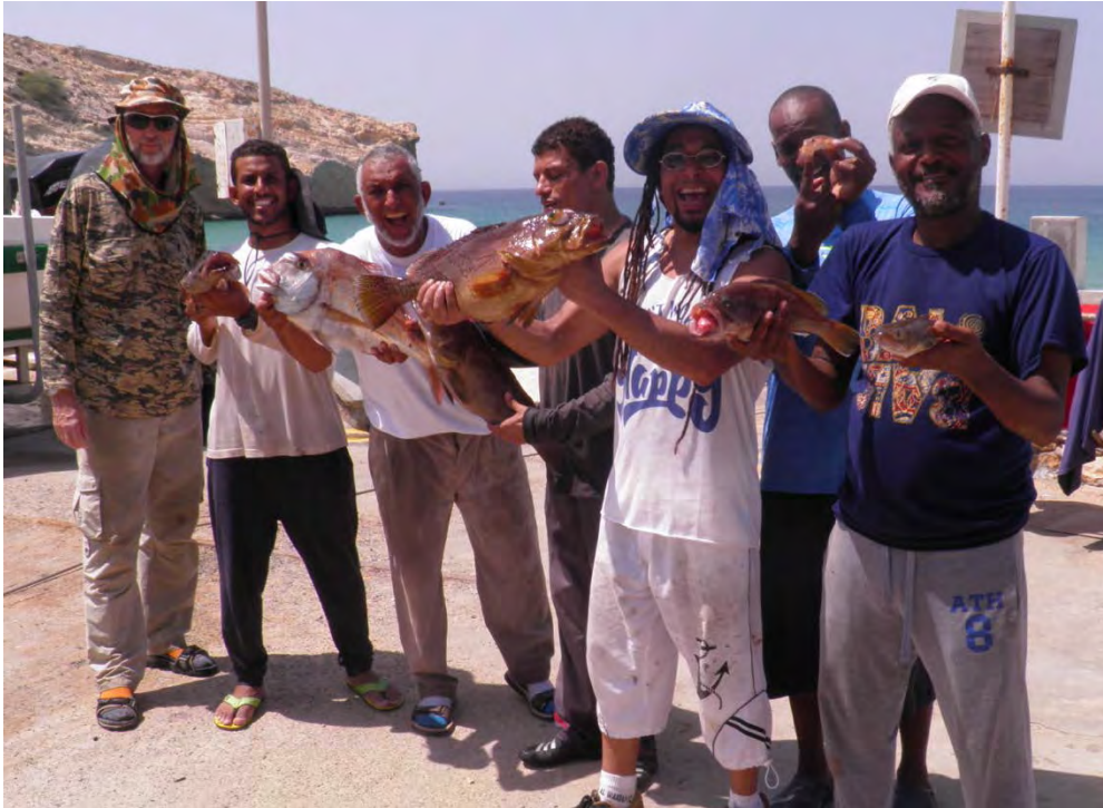
The Anglers with the biggest catch of the day

The event ended with a great lunch at the boat club.