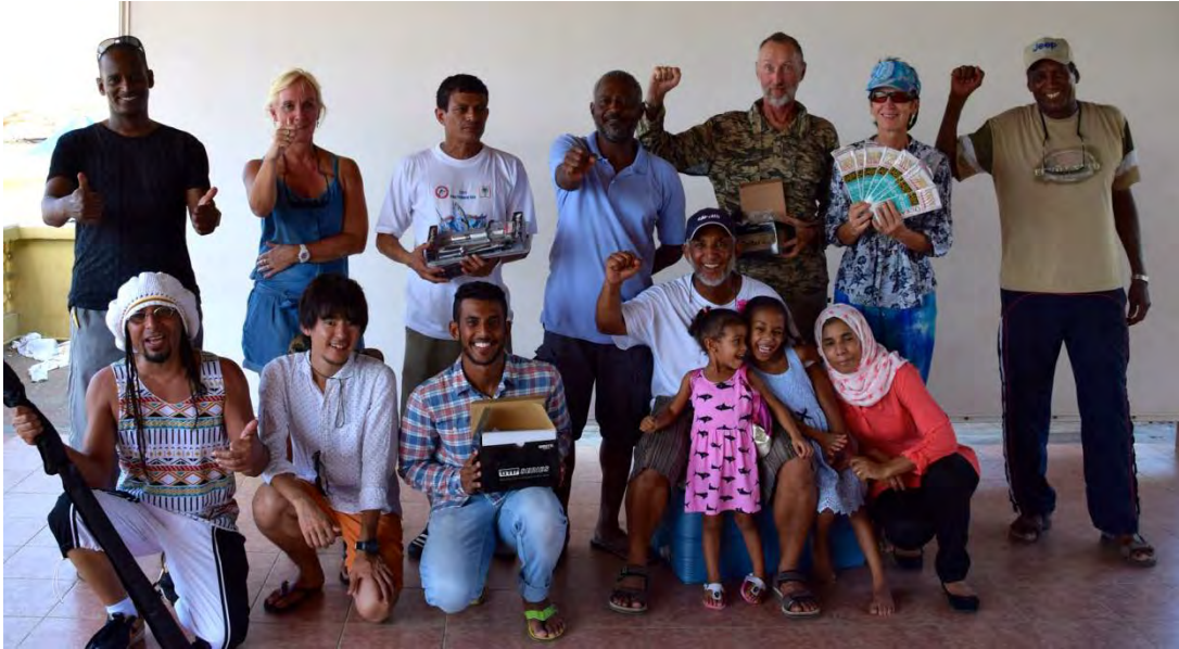
Anglers Family and friends